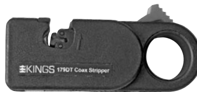
KTS-8-1 AND KTS-8-2