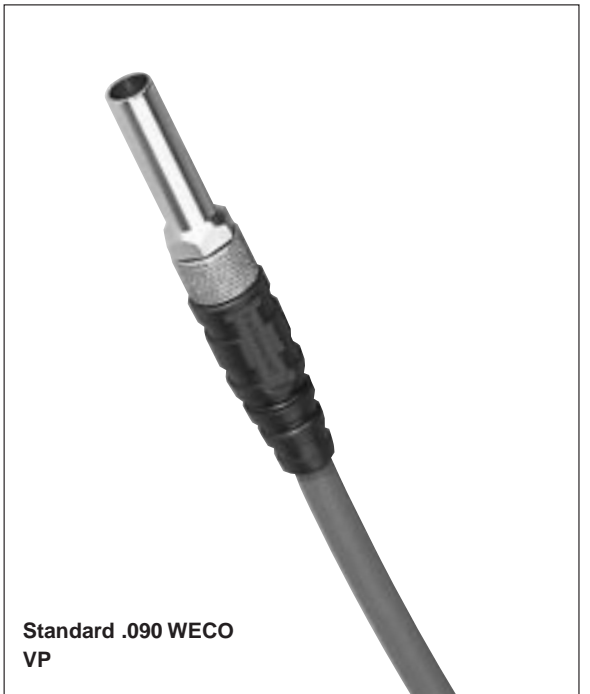
Standard .090 WECO VP