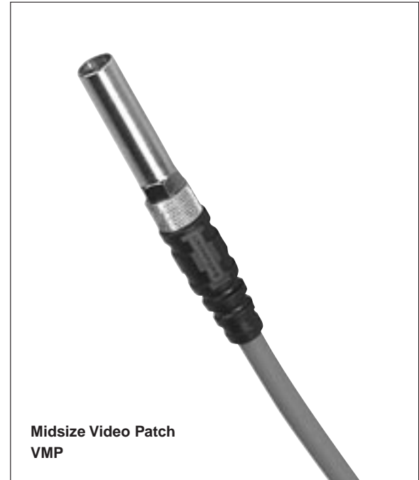
Midsize Video Patch VMP