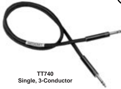
TT740 Single, 3-Conductor