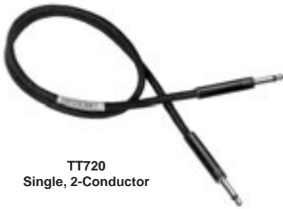
TT720 Single, 2-Conductor