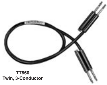
TT860 Twin, 3-Conductor