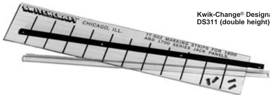
Kwik-Change® Designation Strip DS311 (double height)