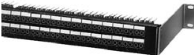
Series TT5502000, TT5602000 (Typical) Shown w/mounting bracket K107 (not supplied).