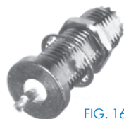
FIG. 16 RFU-602-3