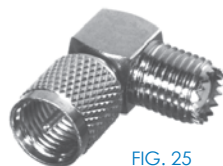
FIG. 25 RFU-630-6, -7, -8