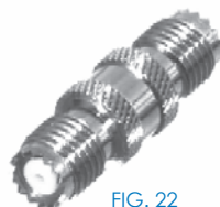
FIG. 22 RFU-629