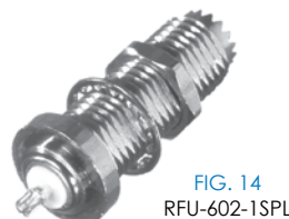
FIG. 14 RFU-602-1SPL