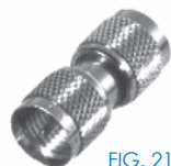
FIG. 21 RFU-624