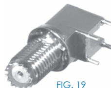
FIG. 19 RFU-606-5