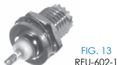
FIG. 13 RFU-602-1