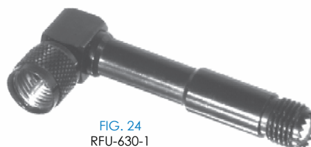
FIG. 24 RFU-630-1