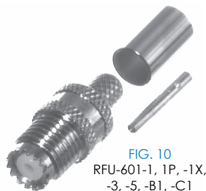
FIG. 10 RFU-601-1, 1P, -1X, -3, -5, -B1, -C1