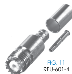
FIG. 11 RFU-601-4