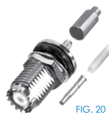
FIG. 20 RFU-617-B, -B1