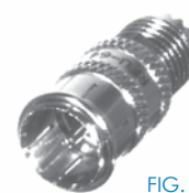
FIG. 28 RFU-643

PHOTOS FOR REFERENCE ONLY, SHOWN AT 100% ACTUAL SIZE.