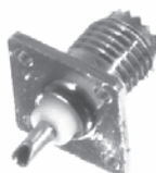
FIG. 17 RFU-603, -1