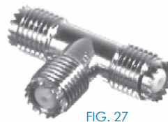
FIG. 27 RFU-632