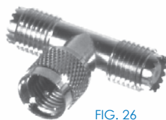
FIG. 26 RFU-631