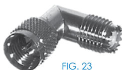
FIG. 23 RFU-630