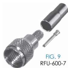
FIG. 9 RFU-600-7