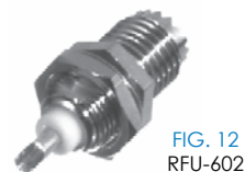
FIG. 12 RFU-602