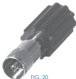
FIG. 20 RFU-551

PHOTOS FOR REFERENCE ONLY, SHOWN AT 75% ACTUAL SIZE.