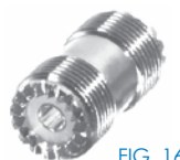
FIG. 16 RFU-536