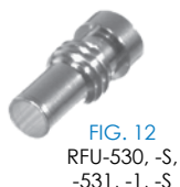
FIG. 12 RFU-530, -S, -531, -1, -S