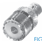
FIG. 19 RFU-545