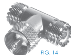
FIG. 14 RFU-533