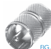
FIG. 18 RFU-538