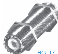
FIG. 17 RFU-537, -SO