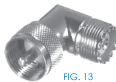
FIG. 13 RFU-532