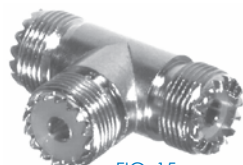
FIG. 15 RFU-534