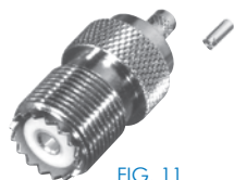
FIG. 11 RFU-527, -T, TC1