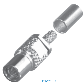
FIG. 1 RSB-700-179-1