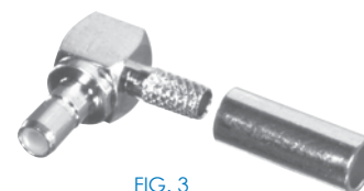
FIG. 3 RSB-750-1B, -1B1

PHOTOS FOR REFERENCE ONLY, SHOWN AT 150% ACTUAL SIZE.