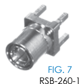
FIG. 7 RSB-260-1