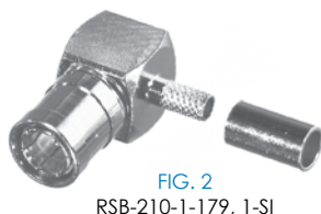
FIG. 2 RSB-210-1-179, 1-S1