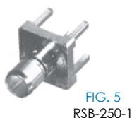
FIG. 5 RSB-250-1