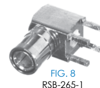
FIG. 8 RSB-265-1

PHOTOS FOR REFERENCE ONLY, SHOWN AT 150% ACTUAL SIZE.