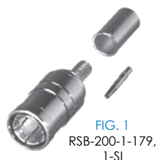
FIG. 1 RSB-200-1-179, 1-S1