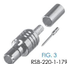
FIG. 3 RSB-220-1-179