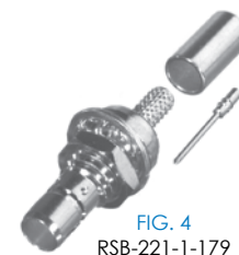
FIG. 4 RSB-221-1-179