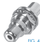
FIG. 4 RCA-1950-03

PHOTOS FOR REFERENCE ONLY, SHOWN AT 100% ACTUAL SIZE.