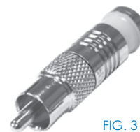
FIG. 3 RCA-1904-01-D, -02-D, -03-D