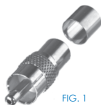
FIG. 1 RCA-1902