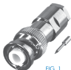
FIG. 1 RHV-100-D