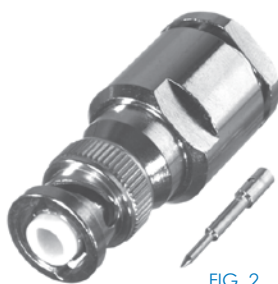
FIG. 2 RHV-100-E, -X