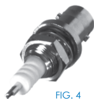
FIG. 4 RHV-116