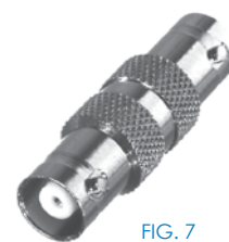
FIG. 7 RHV-134

PHOTOS FOR REFERENCE ONLY, SHOWN AT 100% ACTUAL SIZE.