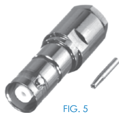
FIG. 5 RHV-124-D