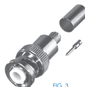
FIG. 3 RHV-106-D