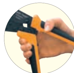
Rubber-embedded handles make a comfortable, non-slip grip

See pg. 47 for our 8000 Series Crimpers & Die Sets