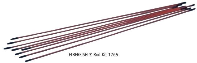
FIBERFISH 3' Rod Kit 1765

Tools developed by cable installers for installers— FIBERFISH cable installation products are versatile, easily transportable and quick to put into action.