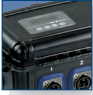
Breakout Box with powerMONITOR