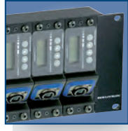
3RU frame with up to 9 powerMONITORS