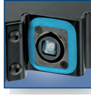
Frame with opticalCON