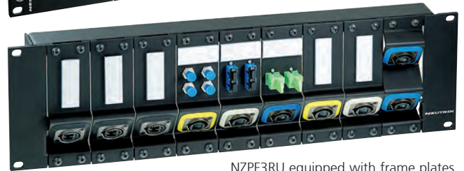
NZPF3RU equipped with frame plates