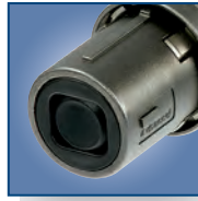
Sealed and rugged housing