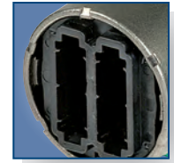
Rear LC connection