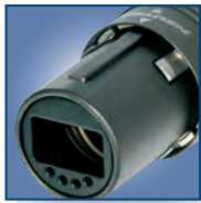
Rugged metal housing