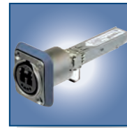
Chassis with transceiver adapter and SFP transceiver