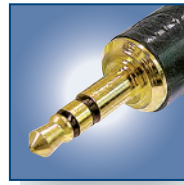
Gold plated contacts