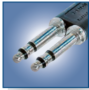
Dual bantam plug