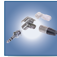
Easy connector assembly