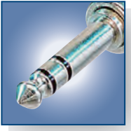
The standard of professional phone plugs