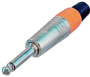
NP2C + BSP-3