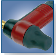
Right angle plug