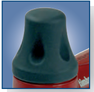
Rotary knob to change the timbre