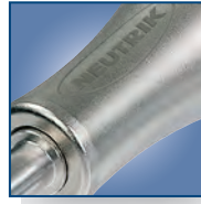
Robust metal housing