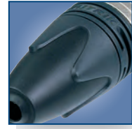
Big bushing for cable up to 10 mm