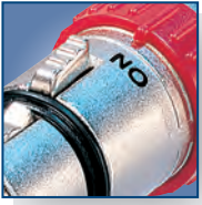
Switch activating ring