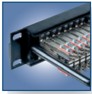
Long frame jack socket