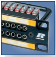
Standard 4.4mm bantam jack