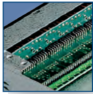
Galvanized metal housing