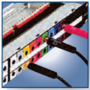
Individual colour coding