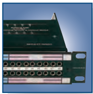
Robust front design