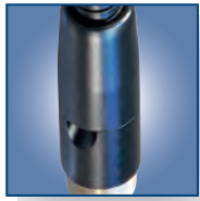
Integrated cable outlet