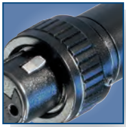
3 pole XLR with securing ring