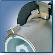
Robust metal housing