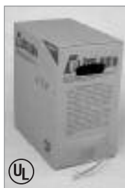
Cat5E & Cat6 Stranded Patch Cable 4 pair, 24 AWG Unshielded, EIA/TIA 568, 1,000 ft. "Reel in Box" with cable length markings.