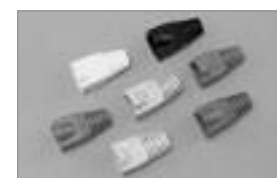
Colored Snagless Boots for RJ-45 8 Conductor Shielded and Unshielded Modular Plugs.