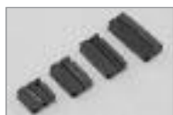
Dual Row Socket Connectors - Headers (0.01" x 1" Spacing w/Strain Relief)